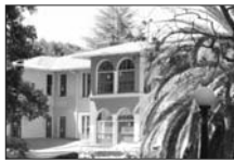
419 Lagunita, Stanford Kingscote Gardens