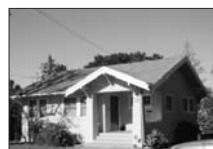
1037 High Street