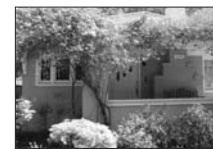
1119 Webster Street