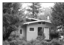
133 Middlefield Road