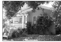
846 Cowper Street