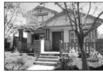
676 Everett Avenue