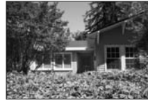
743 Cooksey Lane Stanford