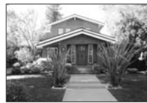
833 Hamilton Avenue