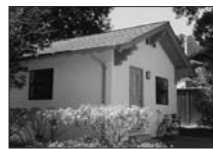
649 Miranda Stanford