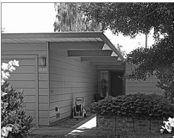
Green Gables Eichler, built in 1950