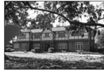
369 Churchill Avenue