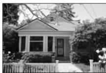
730 Waverley Street Chung Sook Kim