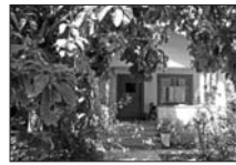
149 Webster Street