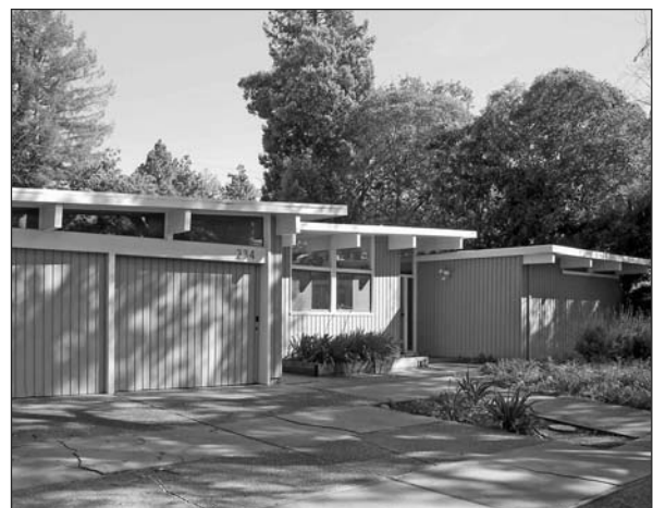
Geenmeadow Eichler, built in 1956